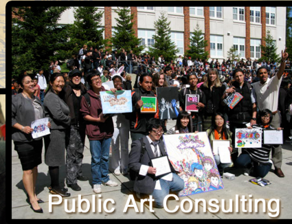
Public Art Consulting