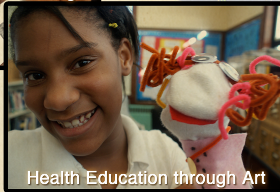
Health Education through Art