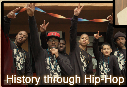
History through Hip-Hop