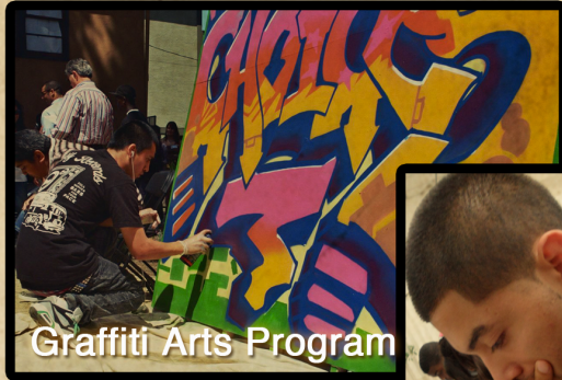
Graffiti Arts Program