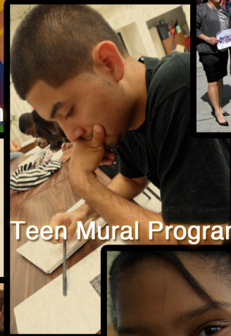
Teen Mural Program